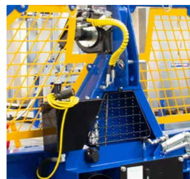
Tank, powder coated inside and outside