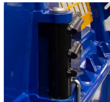
Slewing deflection roller