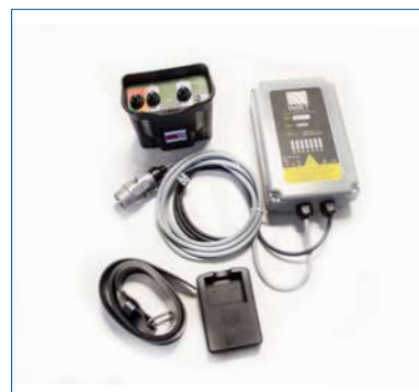
Radio control system "profi"